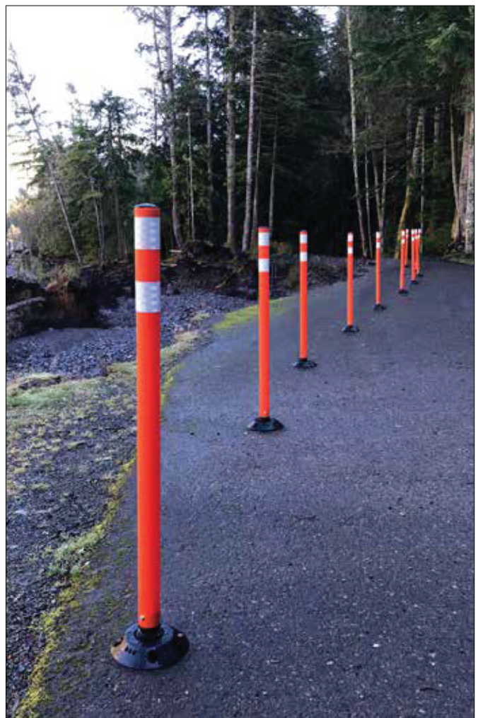
Tubular Surface Mount